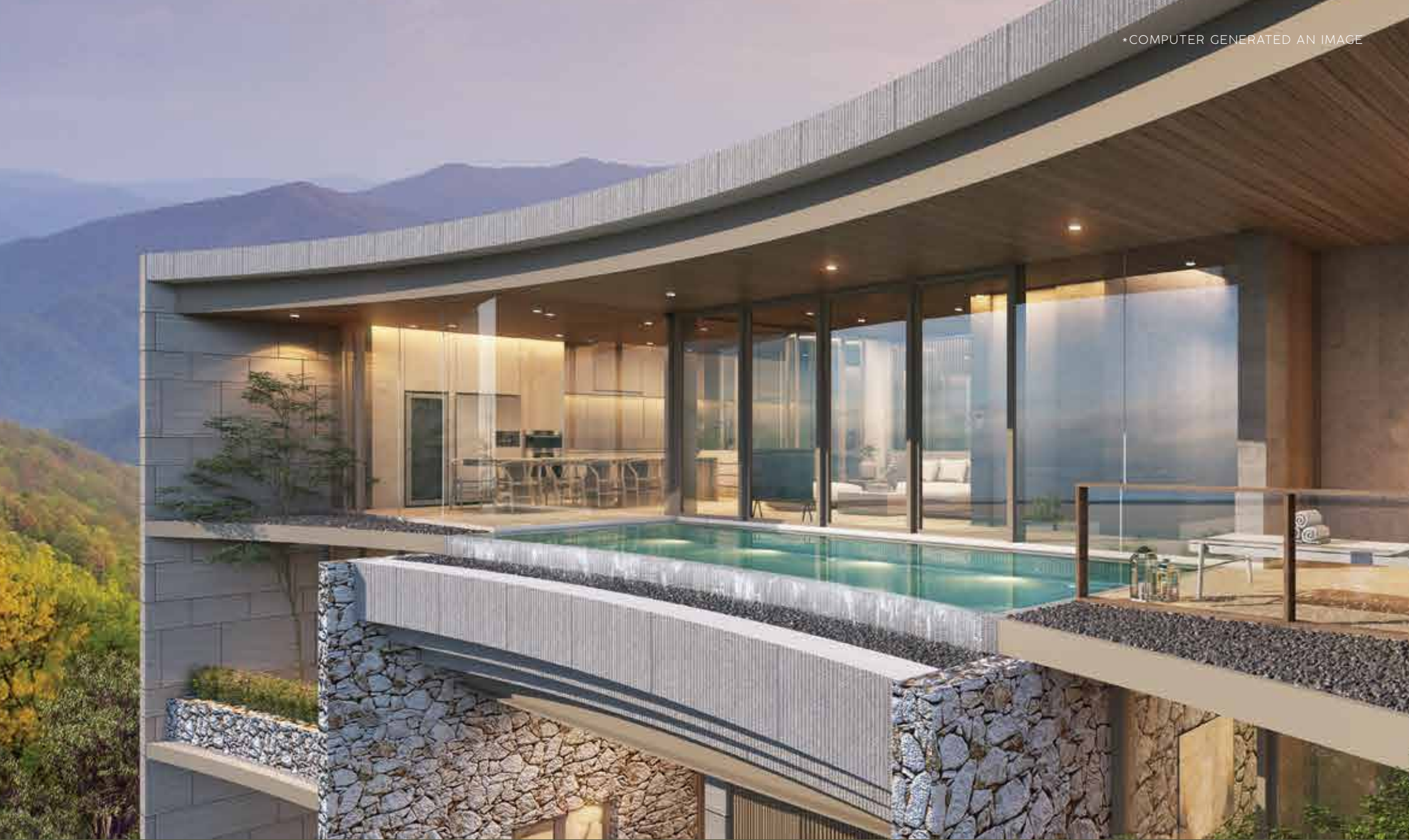
PANORAMIC POOL VIEW